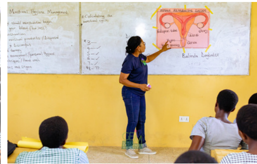
Group session on Menstrual Hygiene