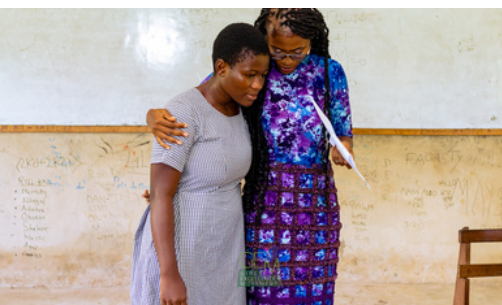
Group session on Confidence Building