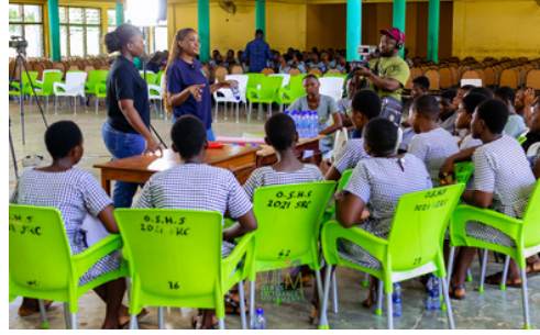
Group session on STEM