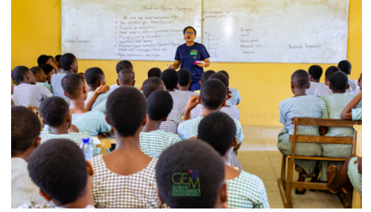
Group session on Menstrual Hygiene