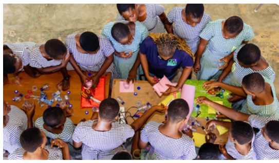
Group session on STEM