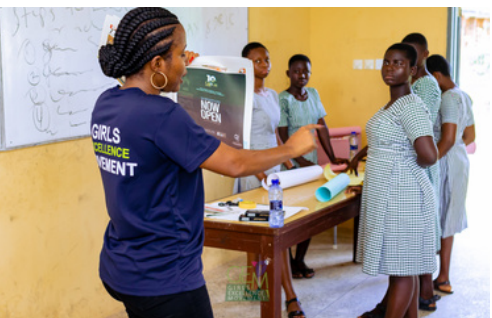
Group session on Vision Board