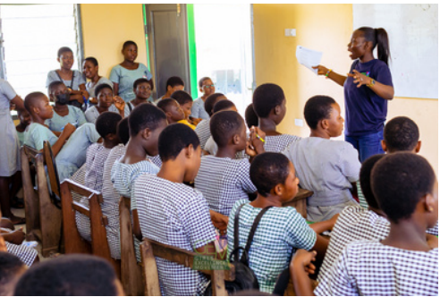
Group session on Positive Thinking