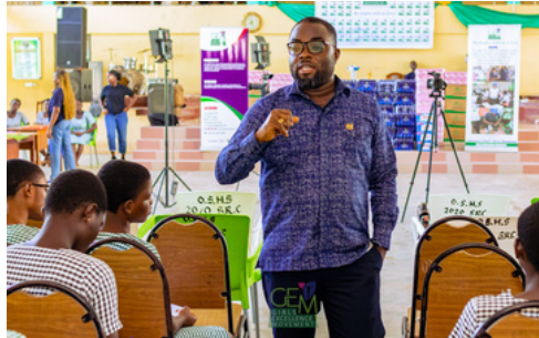
Group session on Healthy Relationship