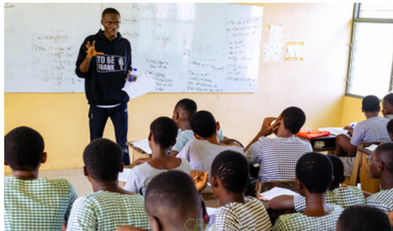
Group session on Studying Effectively