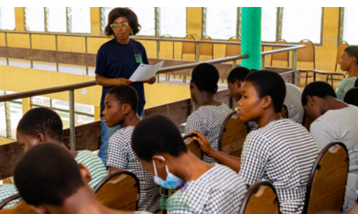
Group session on Personal Hygiene