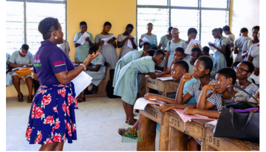
Group session on Financial Literacy